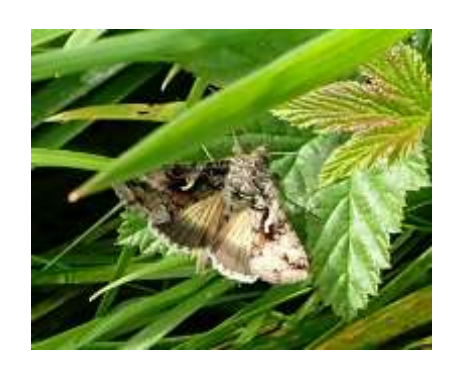
Silver Y moth

The grounds staff at Llwyngwair have been engaged in a battle with alien invaders (see below) tackling some invasive species which are less welcome here in the meadow. As a result, they mow the area several times a year. However, this has resulted in a low diversity of flora with dock, nettle, silverweed and bramble evident.