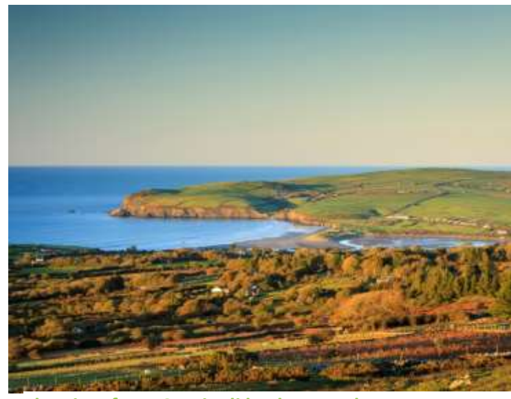
The view from Carningli back towards Newport

alive as the heather and gorse bloom purple and yellow.